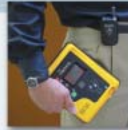
Ready for rescue.