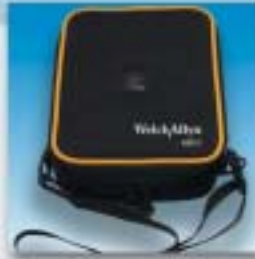
Rugged carrying case.